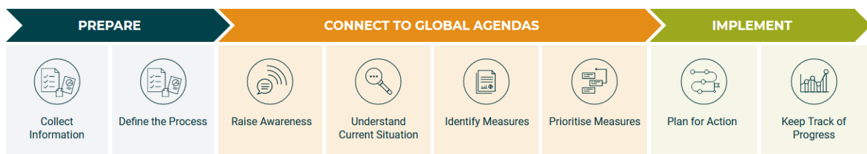
Figure 1: Step by Step approach

City WORKS proposes a standard sequencing along the categories but can also be applied according to the individual needs and demands of a city. In that sense, City WORKS can be applied both sequential or in a non-linear way. Currently, City WORKS is designed as a step-by-step approach targeted at development practitioners (such as advisors, urban planners, consultants) who accompany local governments in connecting local action to global agendas. In the long run, City WORKS shall be developed further so that it can be directly applied by local governments.