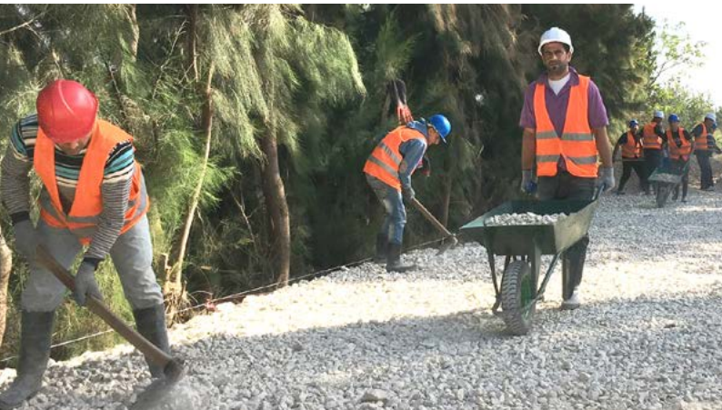
Lebanon, road construction – employment promotion

With the commitments, we support 1.6 million farmers and their families in sustainable management of 23,000 hectares of agricultural land. In addition, around 830,000 farms will receive access to financial services. More than 4.5 million people benefit from the measures to overcome hunger and malnutrition.