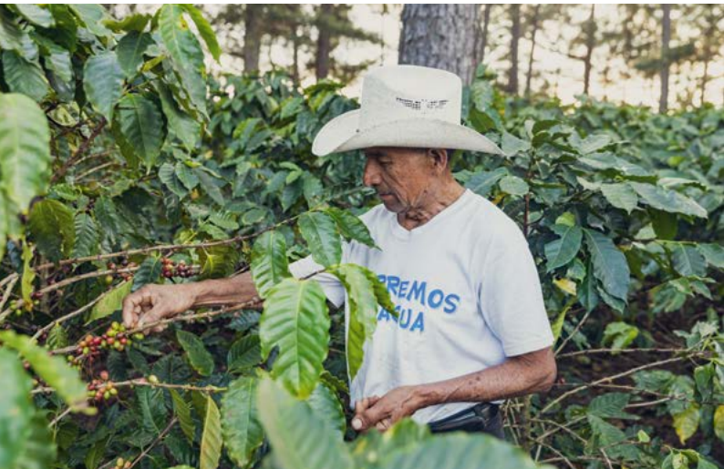
Guatemala, coffee farmer in San Juan Emita

We assume joint responsibility for success from a development policy perspective. Local partners are responsible for preparing and implementing the projects. They put the contracts for advisory services, supplies and services out to public tender and – after review by KfW – conclude the corresponding contracts. When we review the documents, we make sure that tendering and awarding are fair and transparent according to internationally recognised rules. The procurement guidelines are public. In all the projects we promote, we attach importance to ensuring that all participants comply with high international standards with regard to social aspects, anti-corruption and climate and environmental protection.