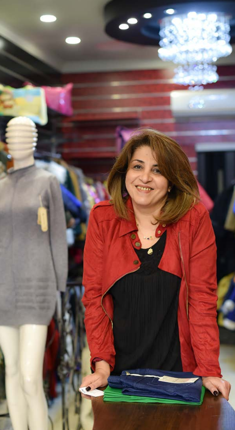
Lebanon, MSME financing