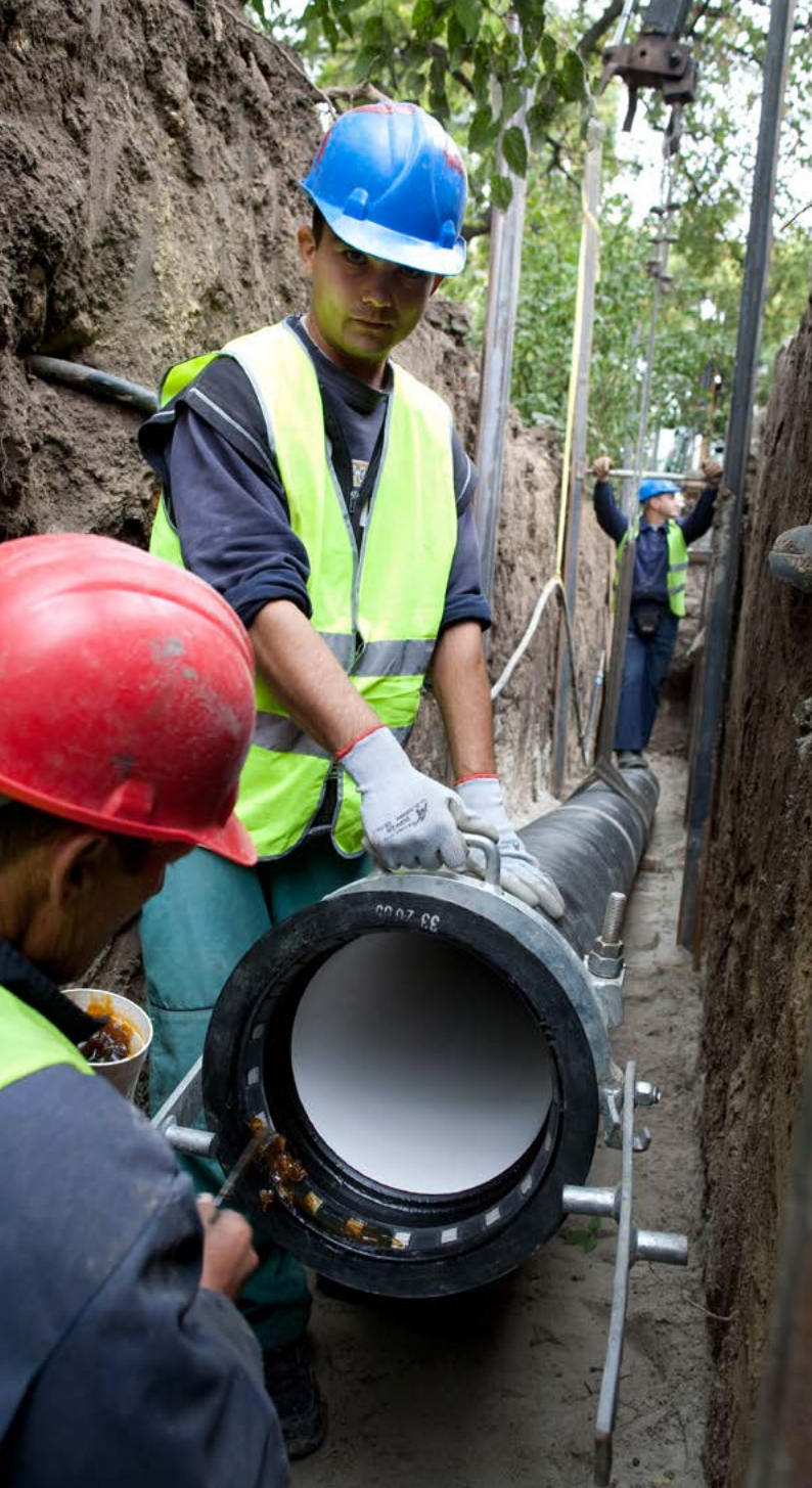
Serbia, water supply