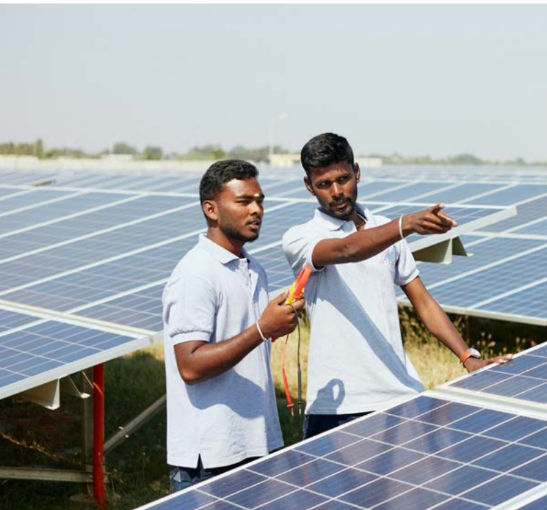
India, Bevinahalli solar plant

Regardless of the client and financing partner, responsibility for implementing the projects always lies with the respective institutions in the partner country – usually ministries, government agencies, state promotional banks or other government agen-